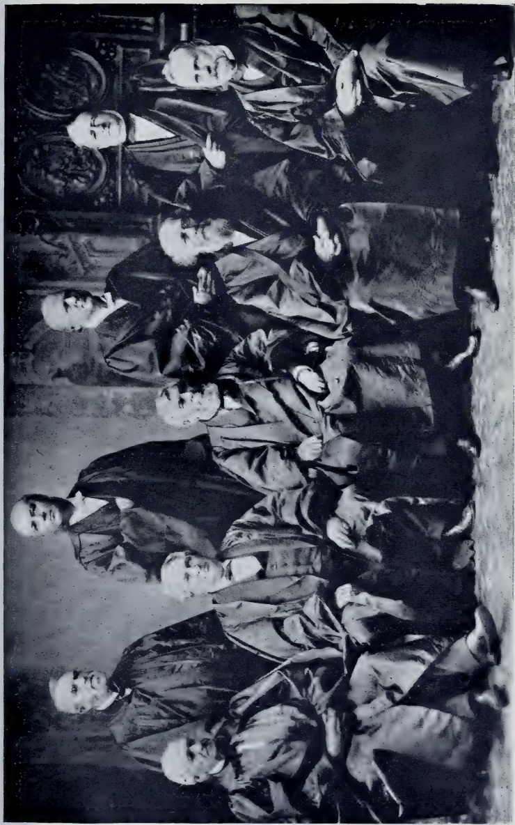
THE SUPREME COURT IN 1882

Standing: Wood, Gray, Harlan, Blatchford. Seated: Bradley, Miller, Chief Justice Waite, Field, Matthews.